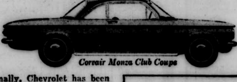
Corvair Monza Club Coupe

Traditionally, Chevrolet has been America's best seller. And right now, more than ever, because the '64 model year is almost over and your Chevrolet dealer has to make room for the '65s, it's America's best buy. But don't wait. Come in and see how great the deals are on these No. 1 cars. Come in now while there's still a big selection of models and colors. Come pick your favorite while the picking's still good. Next week may be too late. Hurry!