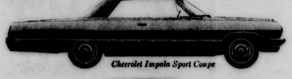
Chevrolet Impala Sport Coupe

The perfect time to get the best deal on America's No. 1 cars