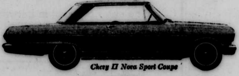
Chevy II Nova Sport Coupe