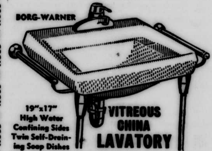
Model No. I-2440

19"x17" High Water Confining Sides Twin Self-Draining Soap Dishes