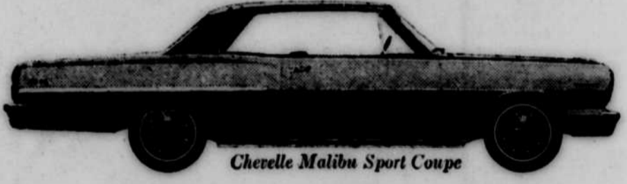
Chevelle Malibu Sport Coupe