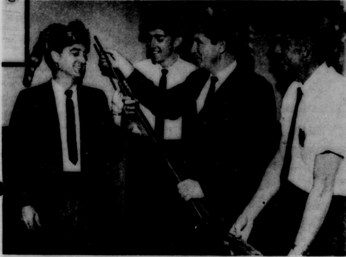
PLANS JELLYING FOR MOUNTAINEER DAYS—Four members of the Kings Mountain Merchants Association...