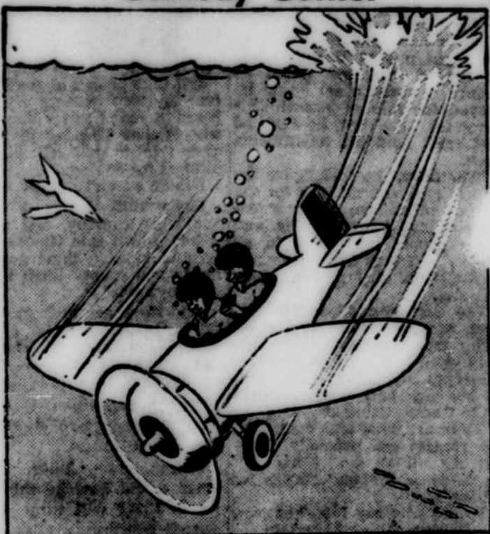
"I don't think you have the idea about what I mean when I say 'deep dive!'"