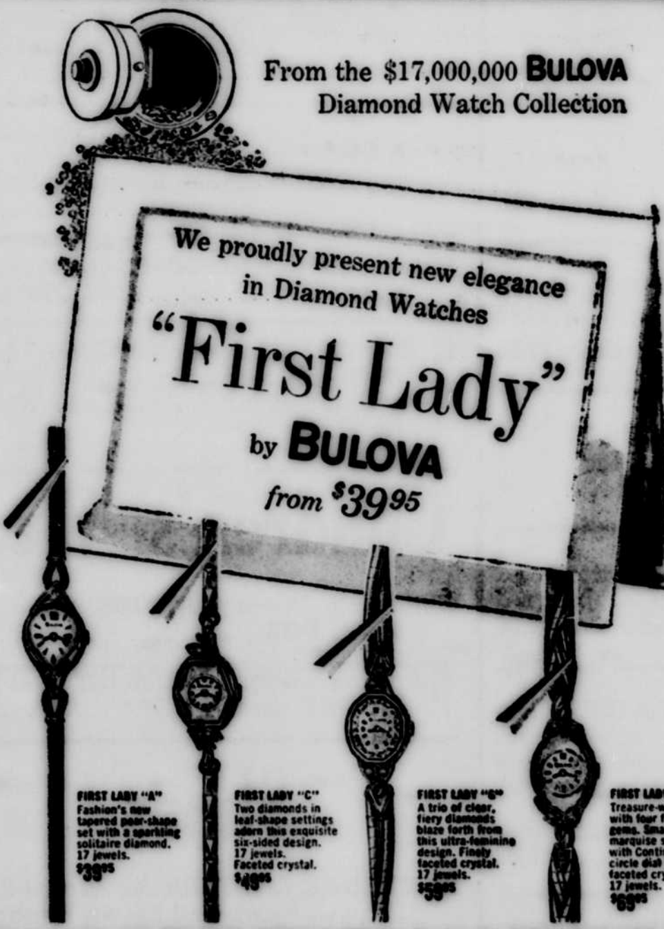
FIRST LADY "A" Fashion's new tapered pear-shape set with a sparkling solitaire diamond. 17 jewels. $39.95

We proudly present new elegance in Diamond Watches "First Lady" by BULOVA from $39.95