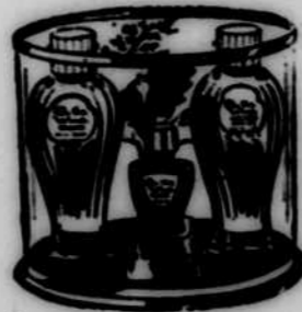
#4041 Say it with orchids...AND... "On The Wind"! Matchless "On The Wind" Cologne, Perfume and Perfumed Bath Oil in a festive orchid presentation. only $1.50