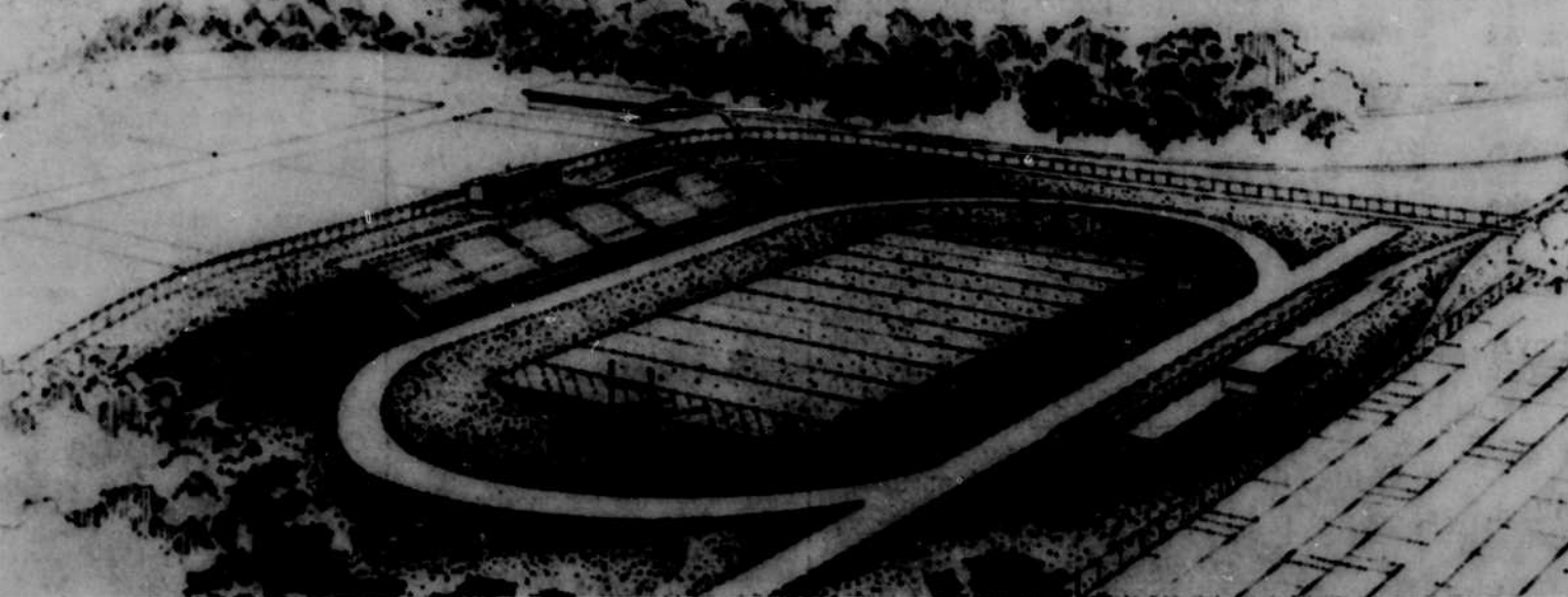
PROPOSED GAMBLE FOOTBALL STADIUM — The photograph above is architect's drawing of the proposed John Gamble Football Stadium to be erected at the site of the new $1.1 million high school plant on Phifer road. Plan of the committee is for construction of a 4,000-seat football stadium, comparable to Shelby's Blanton Memorial, and to include facilities for track. The $30,000 stadium is to be built from public subscription