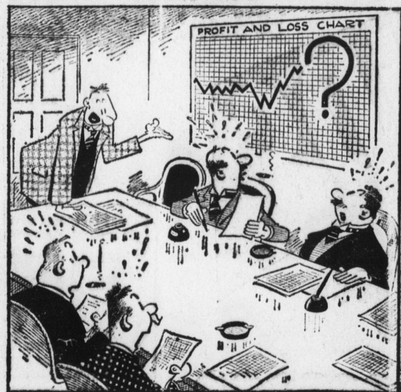
"And that, gentlemen, is where the treasurer disappeared!"