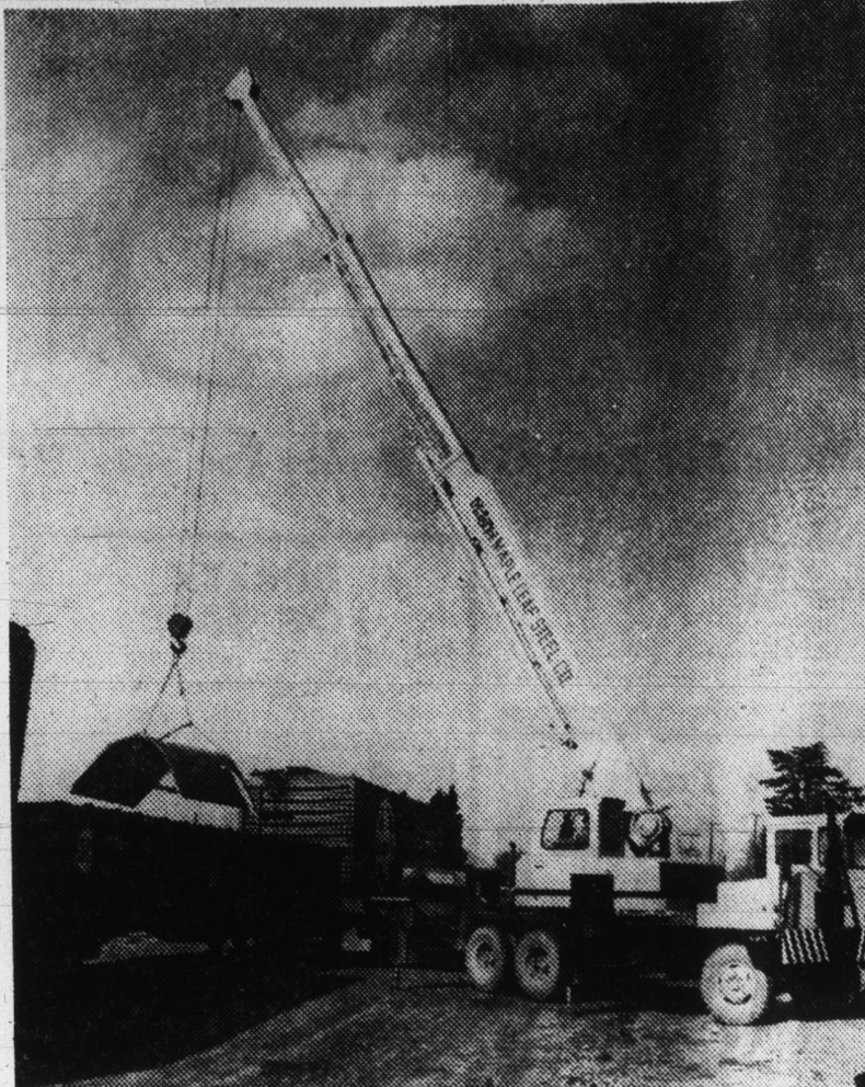
BIG CRANE ON THE JOB — Maple Leaf Steel Company, Inc., recently acquired a Grove 15-ton capacity crane, completely hydraulic, with an 82-foot boom.