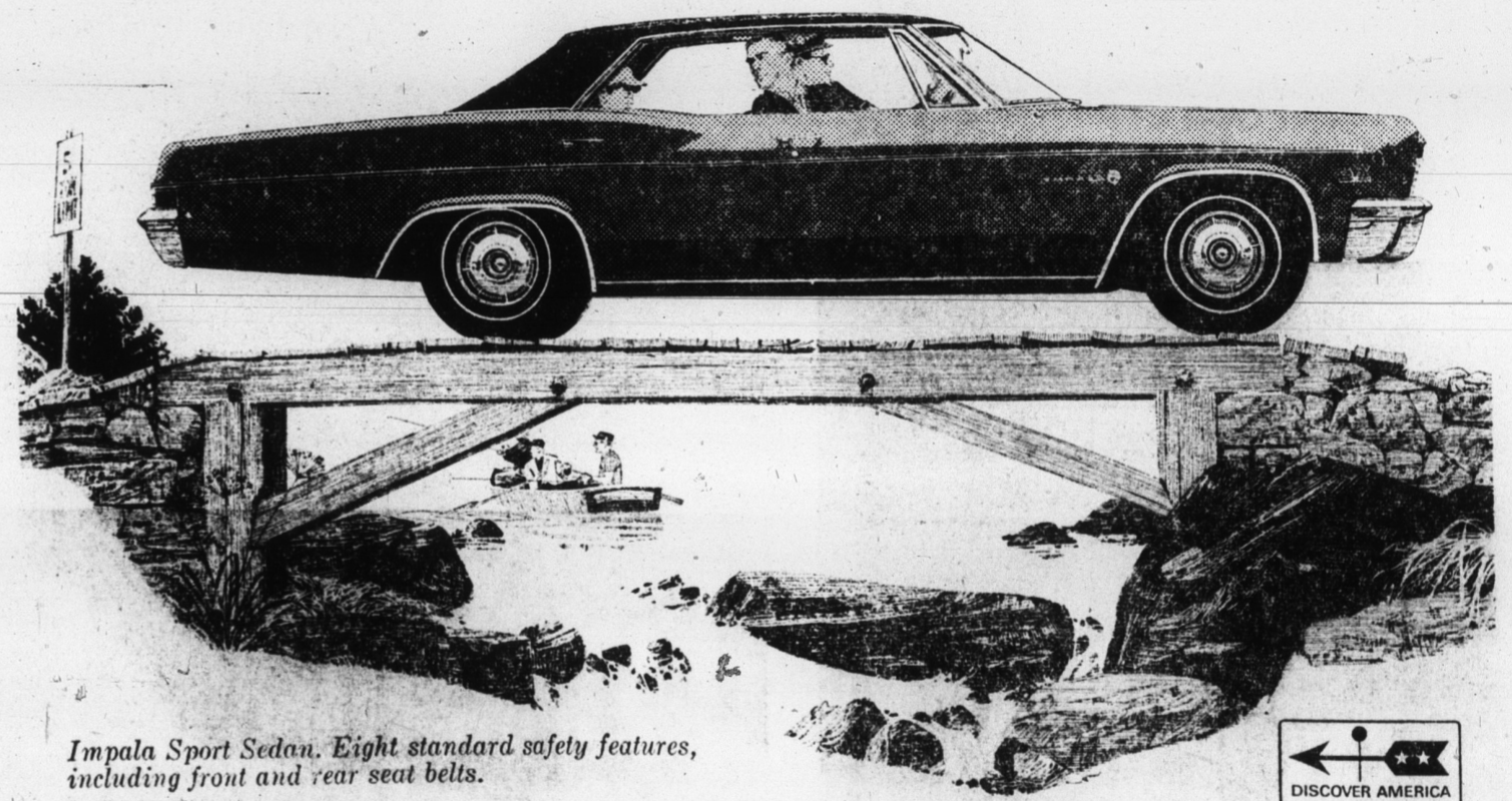
Impala Sport Sedan. Eight standard safety features, including front and rear seat belts.

CHEVROLET'S ALWAYS BEEN FAMOUS FOR SMOOTHING OUT ROUGH ROADS And right now for a Double Dividend, you get a buy that'll smooth out your budget!