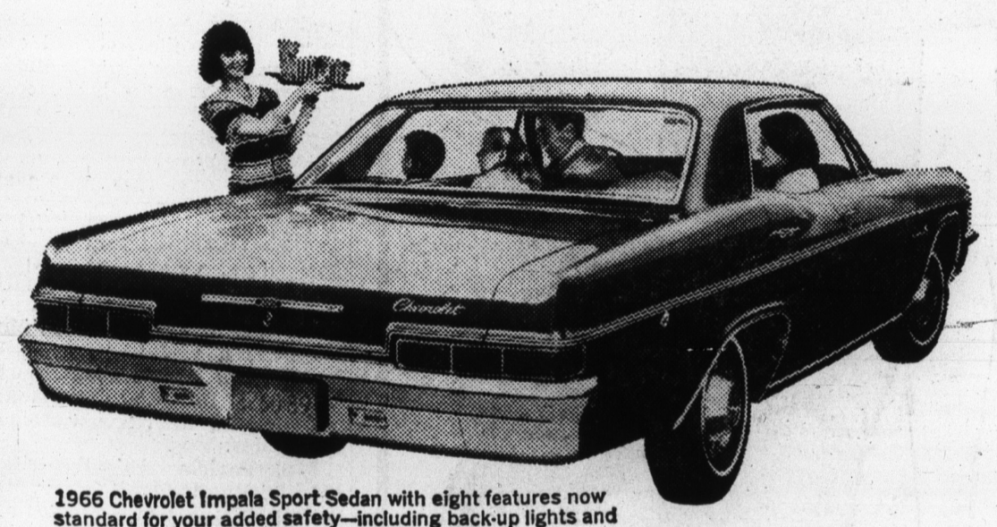
1966 Chevrolet Impala Sport Sedan with eight features now standard for your added safety—including back-up lights and seat belts front and rear (always buckle up!).

What you get is • The meticulous coachwork of Body by Fisher that surrounds you with rich appointments, deep-twist carpeting • Full Coil suspension that uncrinkles roads • Magic-Mirror finish • Gobs of room for hips, legs and feet. What you can add includes • Comforton automatic heating and air conditioning—spring weather the year round • AM-FM multiplex stereo radio • Tilt-telescopic steering • Power everything—brakes, windows, seats, steering. See your Chevrolet dealer now. You'll never find a better time to buy, so Whatayawaitinfor? Big-saving summer buys on Chevrolet, Chevelle, Chevy II and Corvair. See your Chevrolet dealer for fast, fast delivery on all kinds of Chevrolets... V8's and 6's!