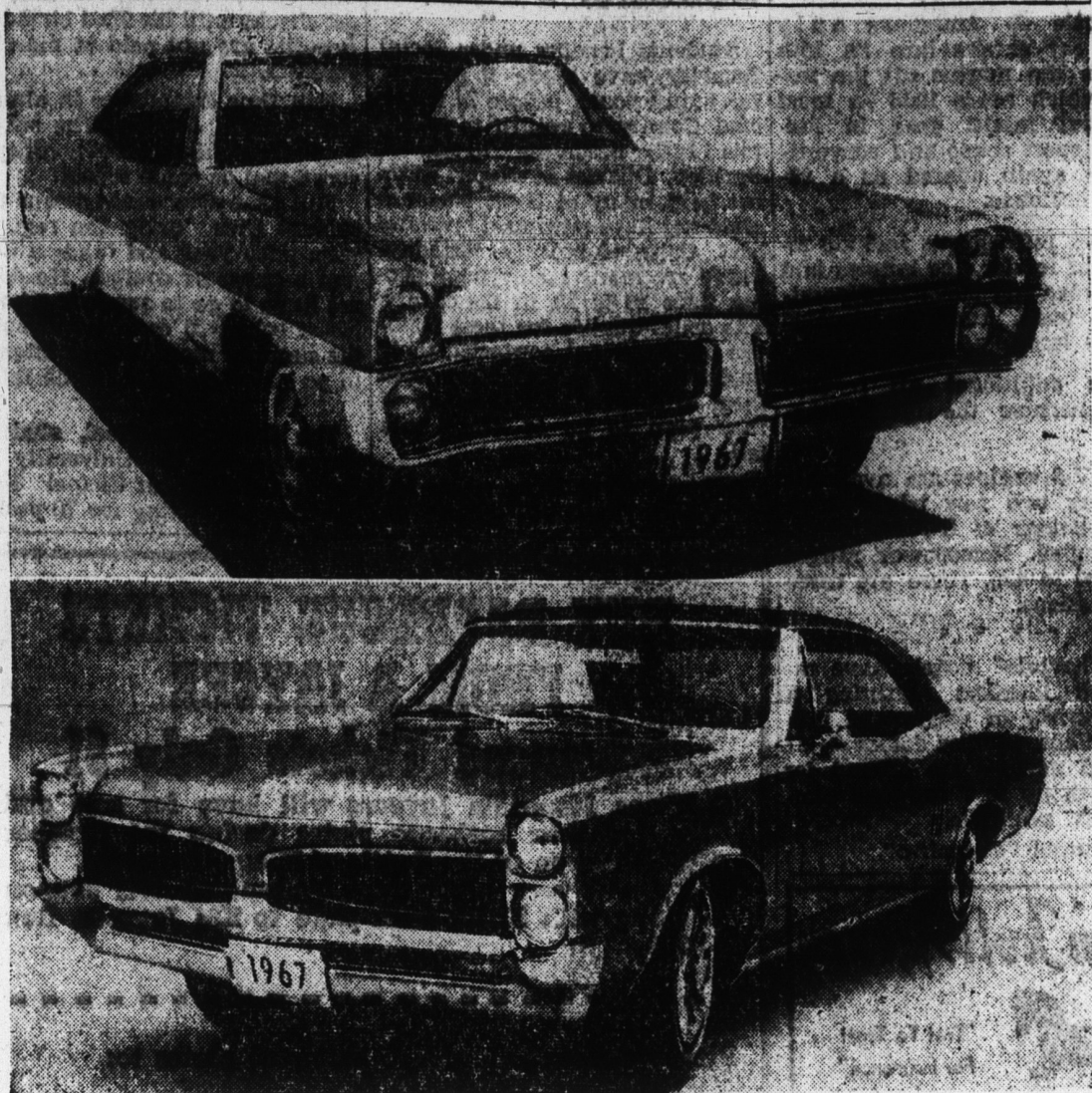
Pontiac's volume-selling Catalina series is represented in the top photo above by the 1967 hardtop coupe with the Ventura option. The Catalina's distinctive styling, interiors and colors, many standard equipment safety items and a wide selection of options has made this Pontiac one of the industry's largest selling cars. The Pontiac Le Mans series is represented in the lower photo by the hardtop coupe. Separate styling features on the side, front and rear gives each Le Mans model a new and different look. The new models will be shown to the public for the first time September 29th.