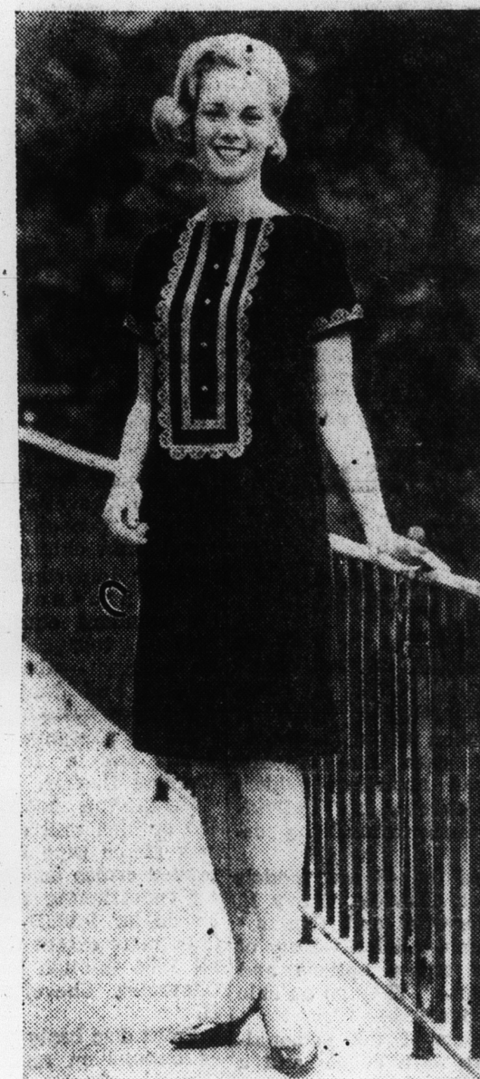
MISS NORTH CAROLINA 1966

It's Exciting! It's Informative! It's the Fair — 43rd annual Cleveland Exposition. A wide, wonderful world of fascinating interest and thrilling amusement for all!