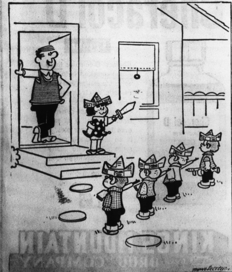
"I see that your Oak Street Striking Force is well covered by the press!"