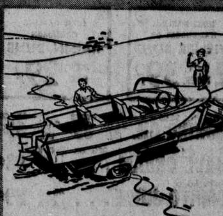
BOATS, MOTORS AND TRAILERS