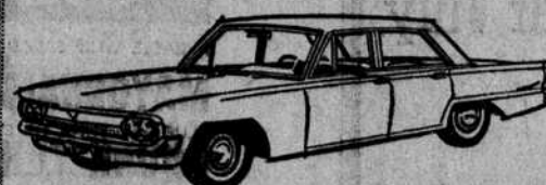
NEW AND USED CARS