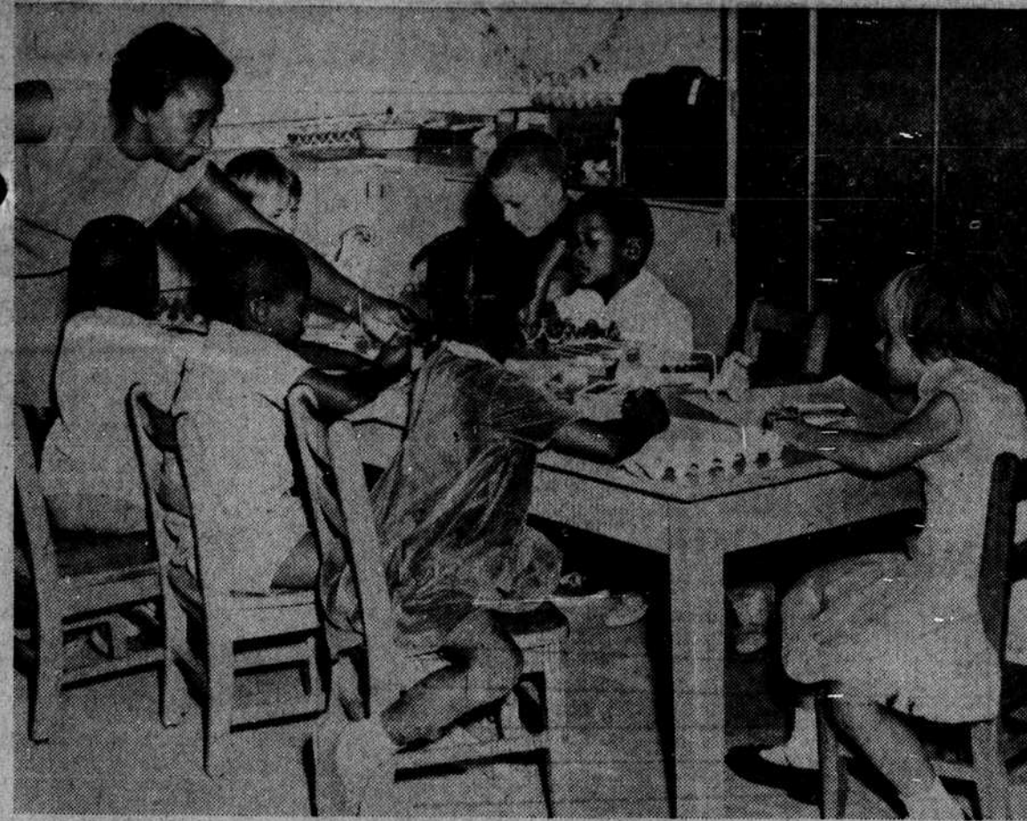
HANDWORK AND CRAFTS—The children, seate I around the table, are being instructed in using paints. In addition, they are taught in units of study, including the story hour, the bedroom, the itchen and the out-of-doors. Numerous field trips were conducted.