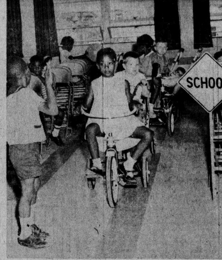
IN SAFETY ROOM—A safety room is feature of the summer program, Operation Head Start, which ends Friday. In the photograph above students observe safety signs as they ride tricycles.