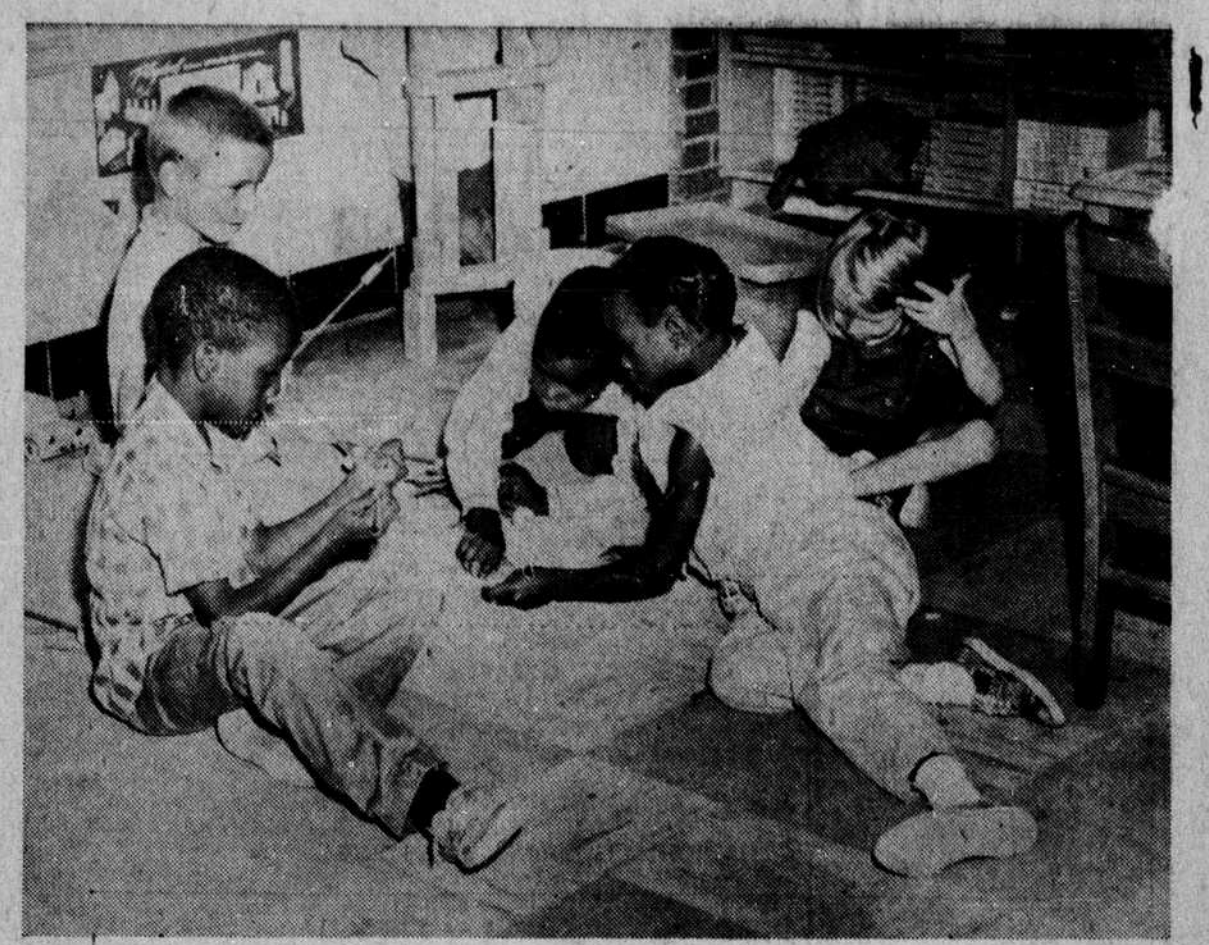
CHILDREN AT PLAY-The 138 pre-schoolers en olled in the second summer of Operation Head Start do lots of things. In the photograph above students play on the floor in the activity room.