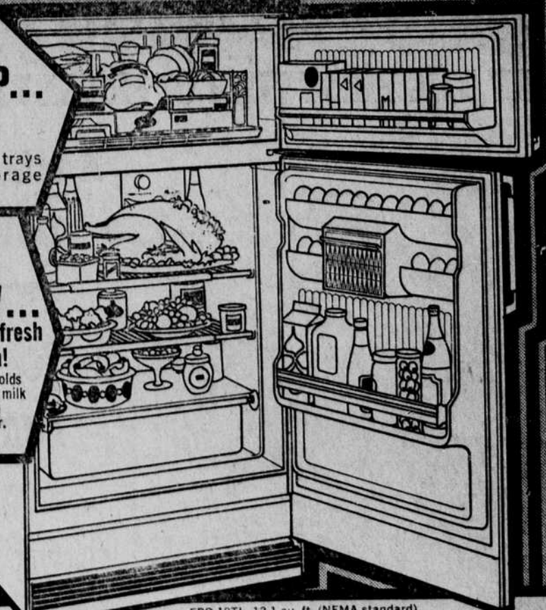
FPD-12TL, 12.1 cu. ft. (NEMA standard)

BIG BELOW... 9.10 cu. ft. fresh food section! Deep door shelf holds tall bottles, bulky milk cartons! Full-width vegetable hydrator. Sliding shelf!