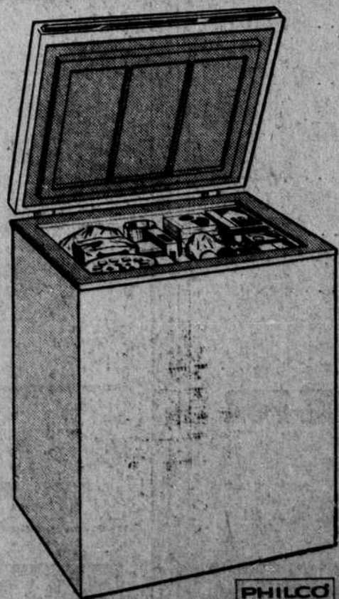
Model 10R05-A $199.95

$3.98 VALUE FASHION GO-GO PAPER SHIFT DRESSES