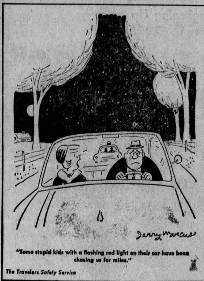
"Some stupid kids with a flashing red light on their car have been chasing us for miles."