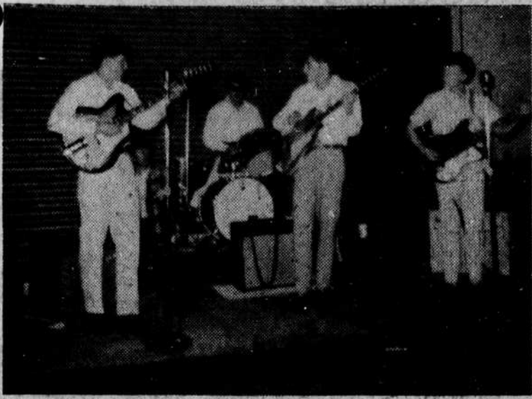
The Manchesters of Simpsonville, S. C. will provide music for Saturday night's dance for Kings Mountain area young people at the National Guard Armory.

Kings Mountain Recreation Activities Committee is sponsoring the event from 8 until 11 p.m.