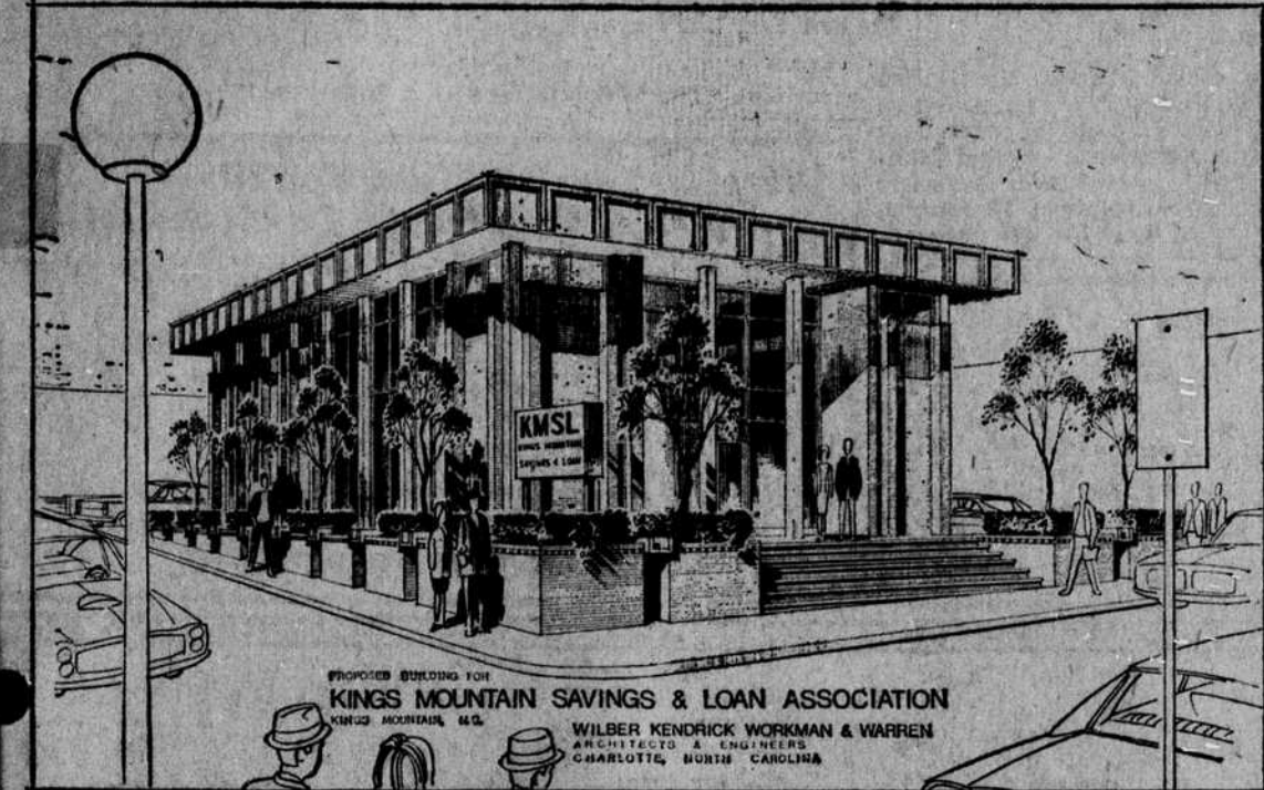
Architect's drawing of proposed new home of Kings Mountain Savings & Loan Association