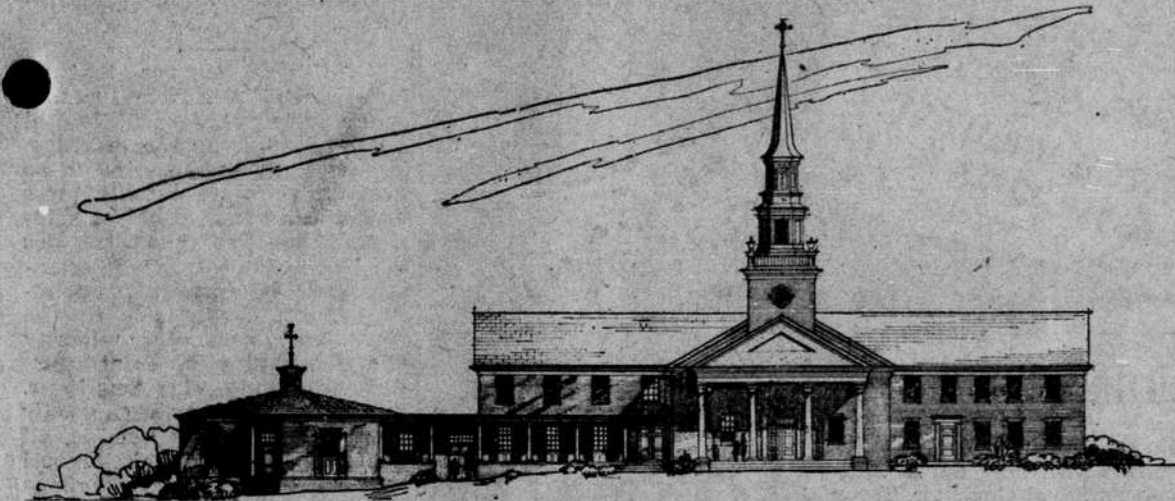
ARCHITECT'S SKETCH FOR PROPOSED $100,000 Addition to Resurrection Lutheran Church on Crescent Circle.