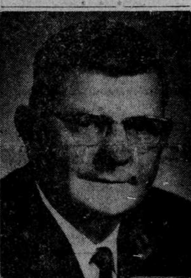
SPEAKER - Congressman Basil L. Whitener will make the address at Saturday night's annual ladies' night banquet of Fairview Lodge 339 AF&AM.

Equipment was being installed in the Mauney Building this week. Public open house will be held on December 9th.