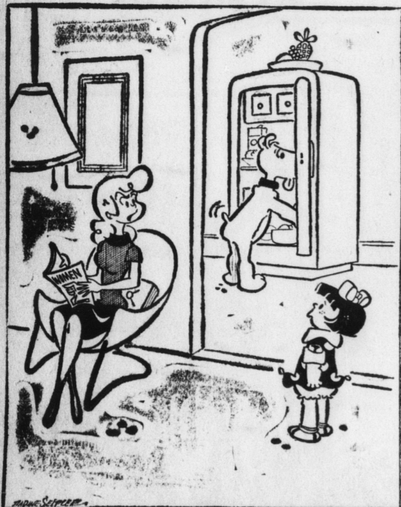
"Don't tell ME the dog is the one who's been raiding that refrigerator!"