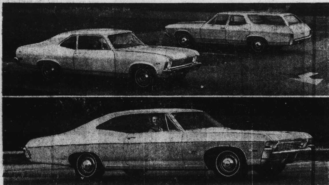
Nova Coupe and Nomad Station Wagon top, Impala Sport Coupe bottom.

Our lowest priced car—Nova Our lowest priced wagon—Nomad Chevrolet—low price is a tradition.