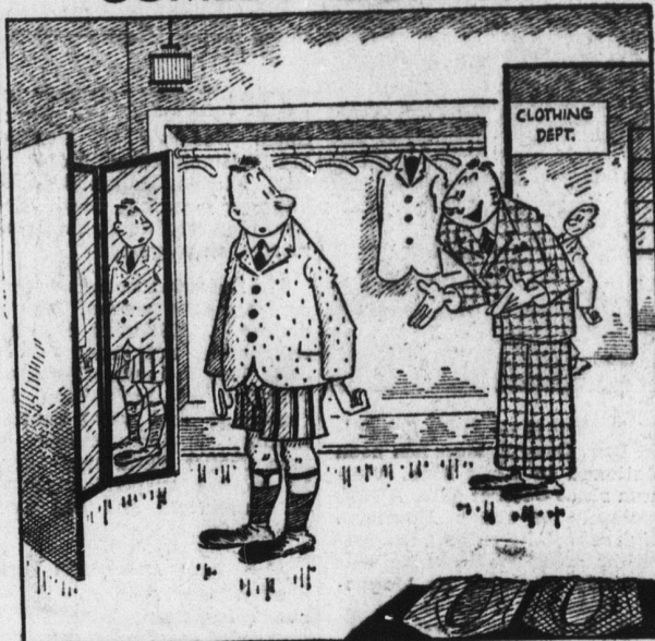
"That no-pants suit will be ideal, especially if you're going to visit Scotland!"