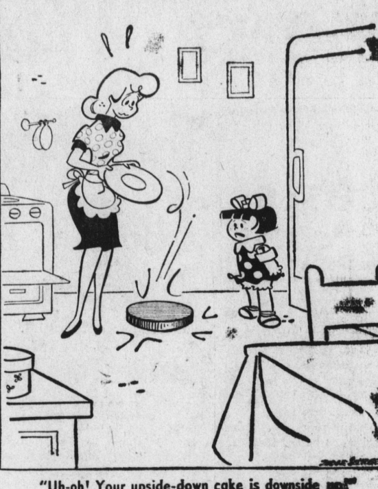
"Uh-oh! Your upside-down cake is downside up