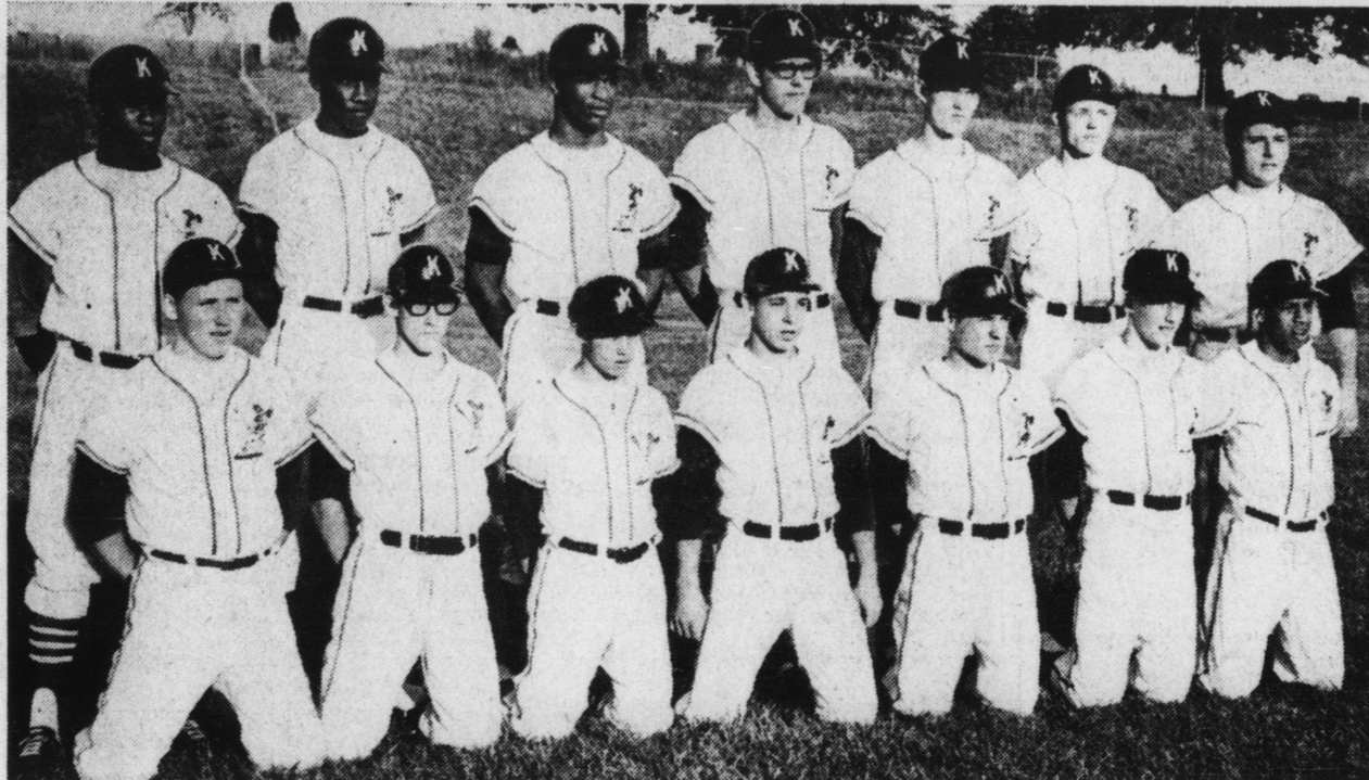
Who Will Win The John Moss Most Valuable Player Award?