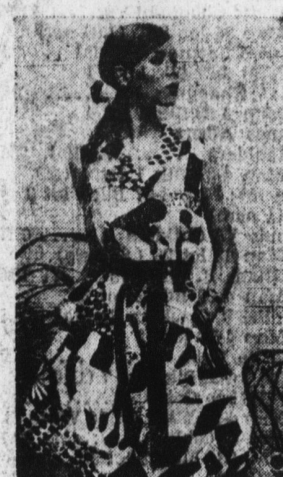
DASHING —Quilted cotton pique in a bold geometric print adds dash to the coat dress. It's zipped down the front, then softly sashed at the waistline. In black and white or espresso and white, it's by Suburbia USA.