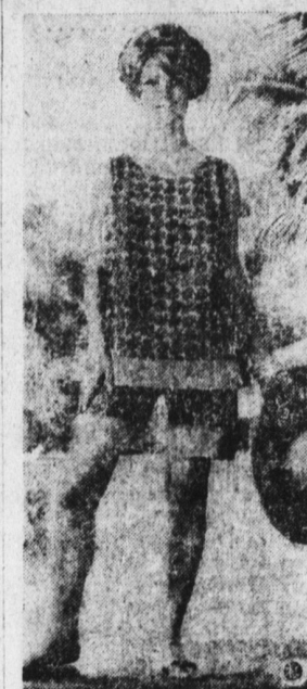
SNAPPY —Here's a versatile pantset that steps out in the sun or moonlights at home. Lowenstein's easy-care cotton canvas in a bright butterfly print shapes a flaring hip-length top and straight-leg shorts. Designed by Society Lingerie.

Overlaid with an imported Italian ecru hand embroidered cloth, the refreshment table in the ballroom was centered with a silver wine cooler holding mums in shades of soft green. Coffee was served from a silver service. Silver trays held sausage biscuits, ribbon sandwiches, chicken salad pastries, cheese straws, and blonde brownies. Fruit punch was served from a smaller table in the ballroom. Arrangements of magnolias were used on the mantels in the lounge and ballroom