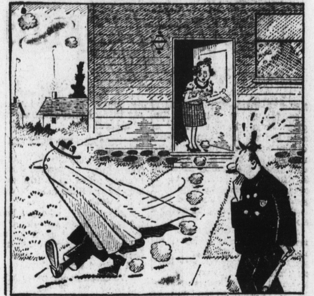
"The laundry made a mistake—they returned sheets instead of shirts!"