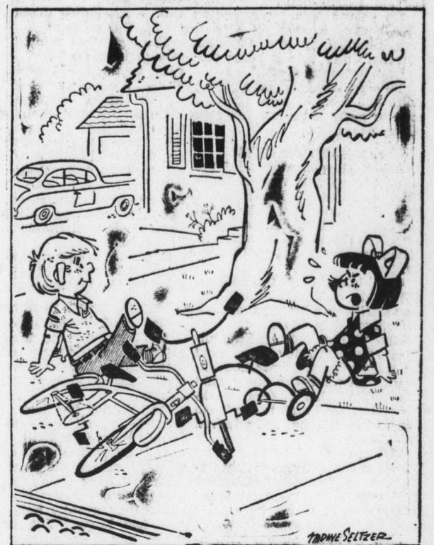
"I don't want to hear a word about women drivers!"