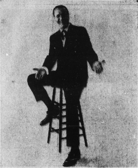
IN CHARLOTTE — Eddy Arnold, one of the most popular and requested entertainers in show business history is coming to the Charlotte Coliseum this Saturday night, November 23rd at 8 p.m. Arnold has been set for practically every facet of the amusement industry: records, one-night concerts, college dates, television and state fairs, just to mention a few.