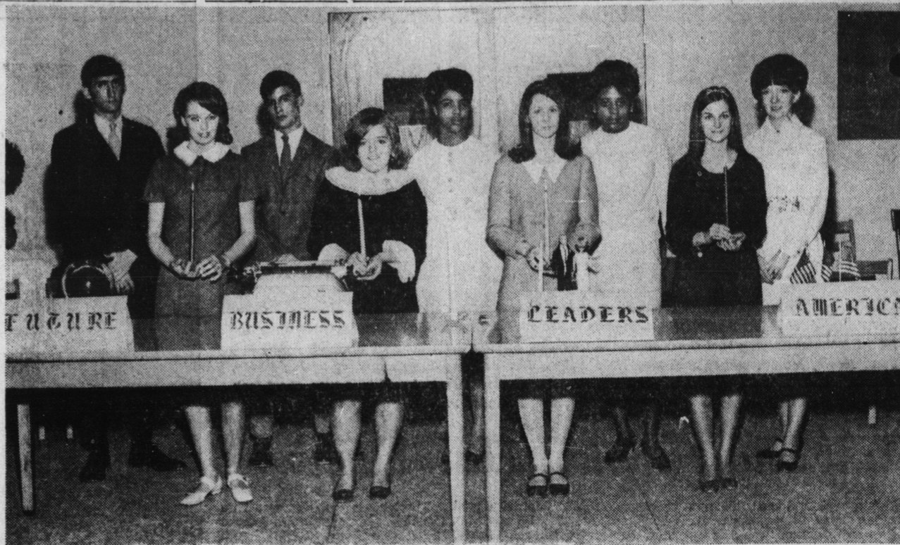
NEW OFFICERS OF FUTURE BUSINESS LEADERS OF AMERICA— Kings Mountain high school unit of Future Business Leaders of America held installation of officers February 26 in the high school cafeteria with the Hickory unit in charge. Participating in the installation were the officers, above, and the installing of-

As far as social security benefits are concerned, it is a good idea to file for them even if you are working. In this way, all the necessary paper work will be completed, and your benefits can start without delay as soon as you do retire.