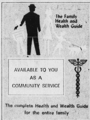
The Family Health and Wealth Guide