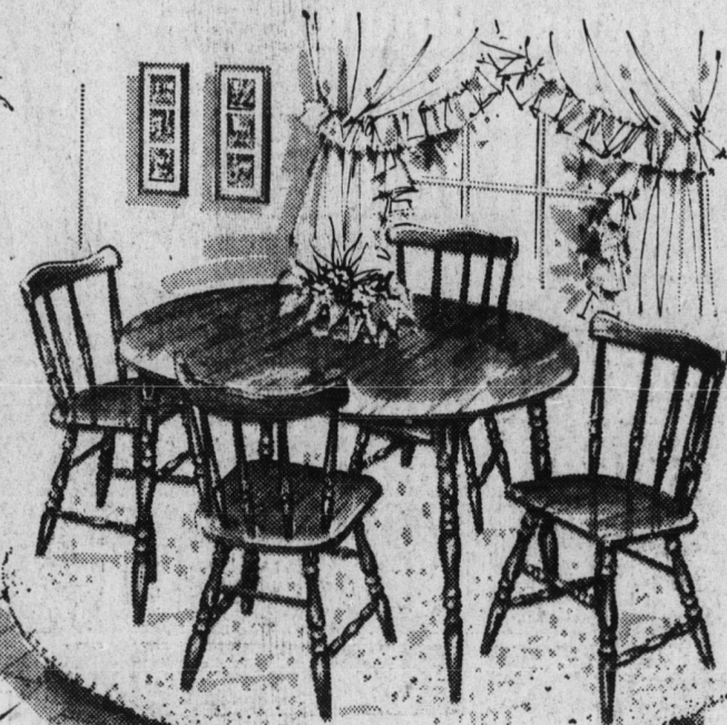
Hi or Low Back Chairs