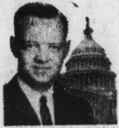
Congressman James T. Broyhill's Washington Report

CIGARETTE ADVERTISING... Interstate and Foreign Commerce Committee, on which I serve, has studied the many arguments both for and against these bans. Last week, the bill recommended for passage by the Committee was considered and passed by the House without major change. The legislation now moves to the Senate where the same arguments will be considered and some de-