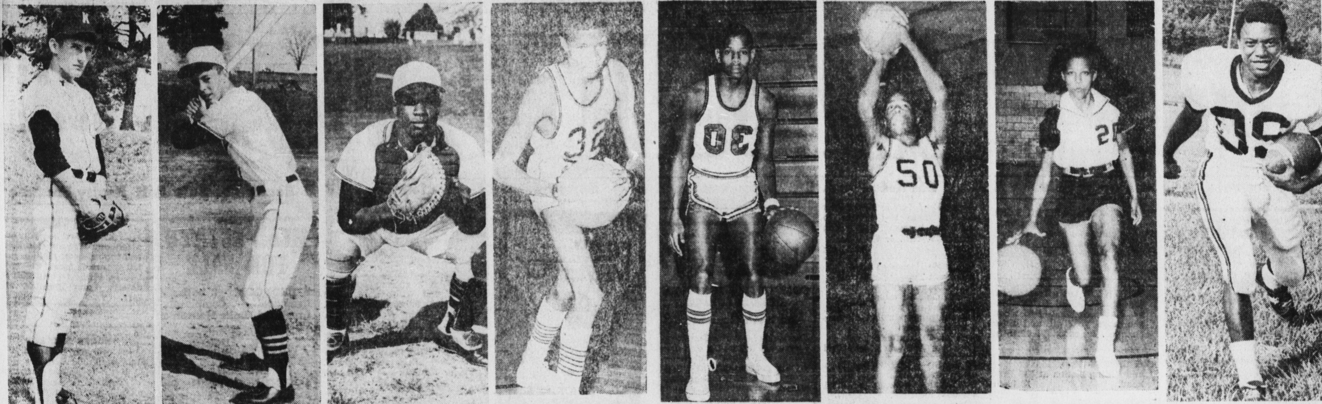
1969 KMHS ALL-CONFERENCE PLAYERS — The eight Kings Mountain High School athletes pictured above were selected to All-Southwest Conference athletic teams during the calendar