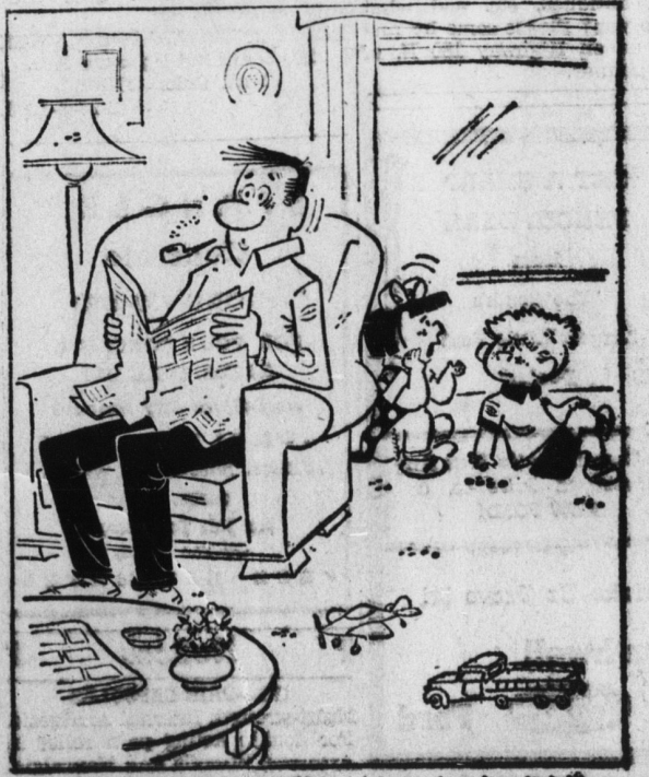
"I was young once myself and I know just how it felt!"