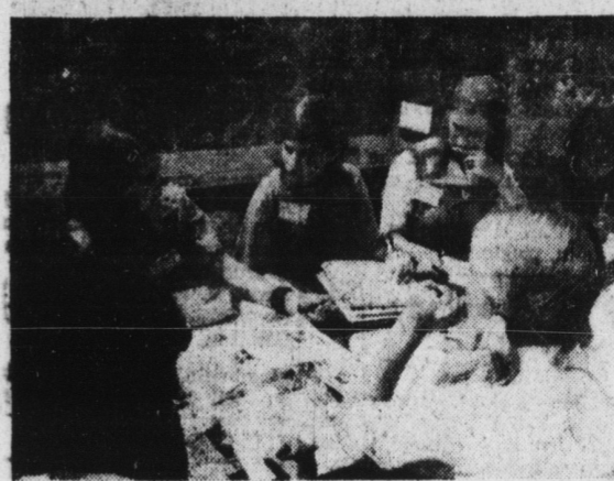
PLANNING BY GIRLS. A group of Senior Girl Scouts meets at Edith Macy Training Center, Pleasantville, N. Y. to discuss the more than 300 ideas for ACTION 70 submitted by teenage girls in Girl Scout councils across the country. ACTION 70 is a nationwide Girl Scout effort to overcome prejudices and build better understanding among all the nation's people.

crease of three million over 1968 and a new high. Computers verified that some 3 percent of individual taxpayers made arithmetic mistakes against themselves, while about 5 percent made errors in their favor.