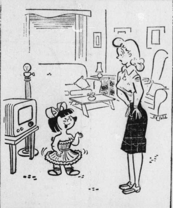
"How do you like my formal? I made it out of the lamp shade!"