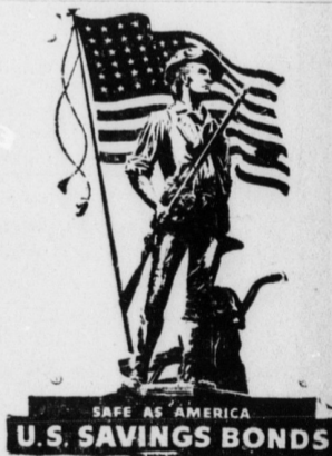
SAFE AS AMERICA U.S. SAVINGS BONDS