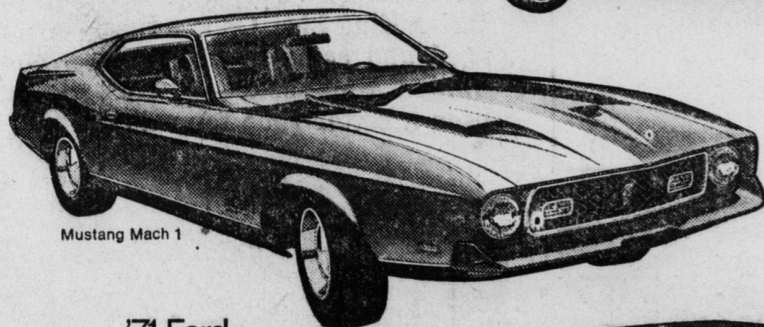
Mustang Mach 1