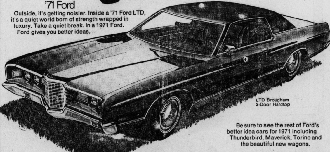
LTD Brougham 2-Door Hardtop

Outside, it's getting noisier. Inside a '71 Ford LTD, it's a quiet world born of strength wrapped in luxury. Take a quiet break. In a 1971 Ford, Ford gives you better ideas.