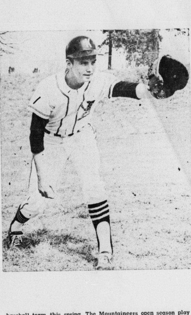
baseball team this spring. The Mountaineers open season play next Tuesday at Dallas.