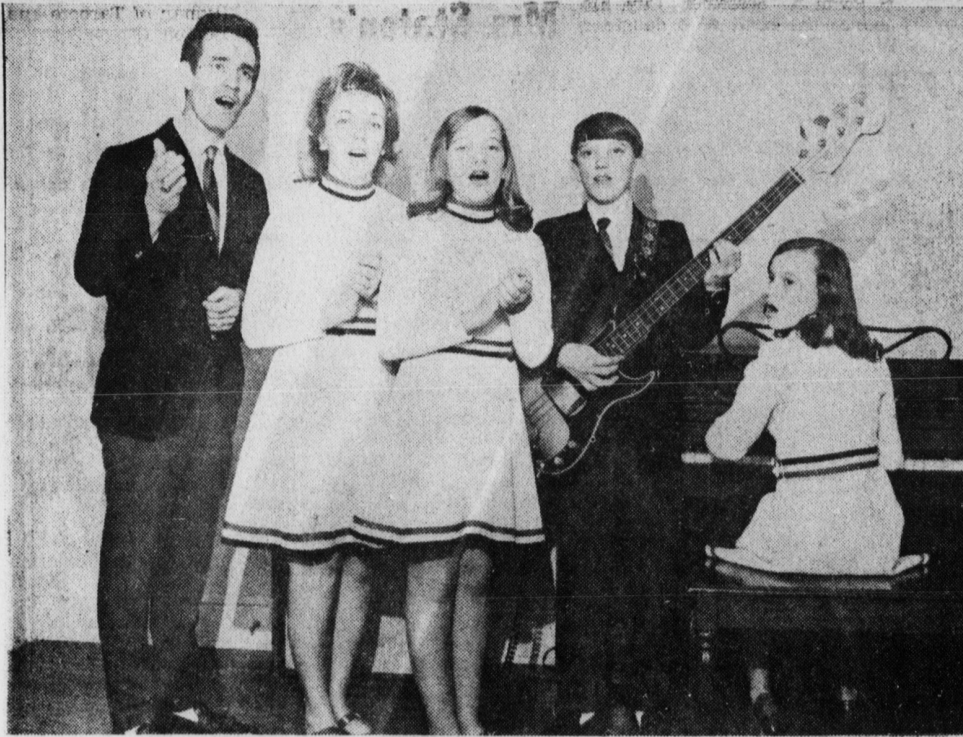
SUNDAY SCHOOL RALLY SET — A Sunday School Rally will be held Sunday morning, March 7, at 10:00 a.m. at the East Cold Street Wesleyan Church in Kings Mountain. The Singing Dogs Family of China Grove, N. C. will be providing special singing for the occasion. The public is invited to attend.