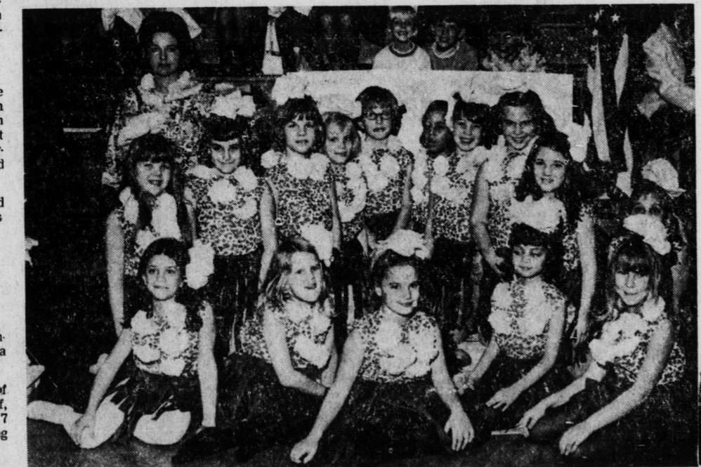
GIRL SCOUT TROOP 52 dress in Hawaiian costume