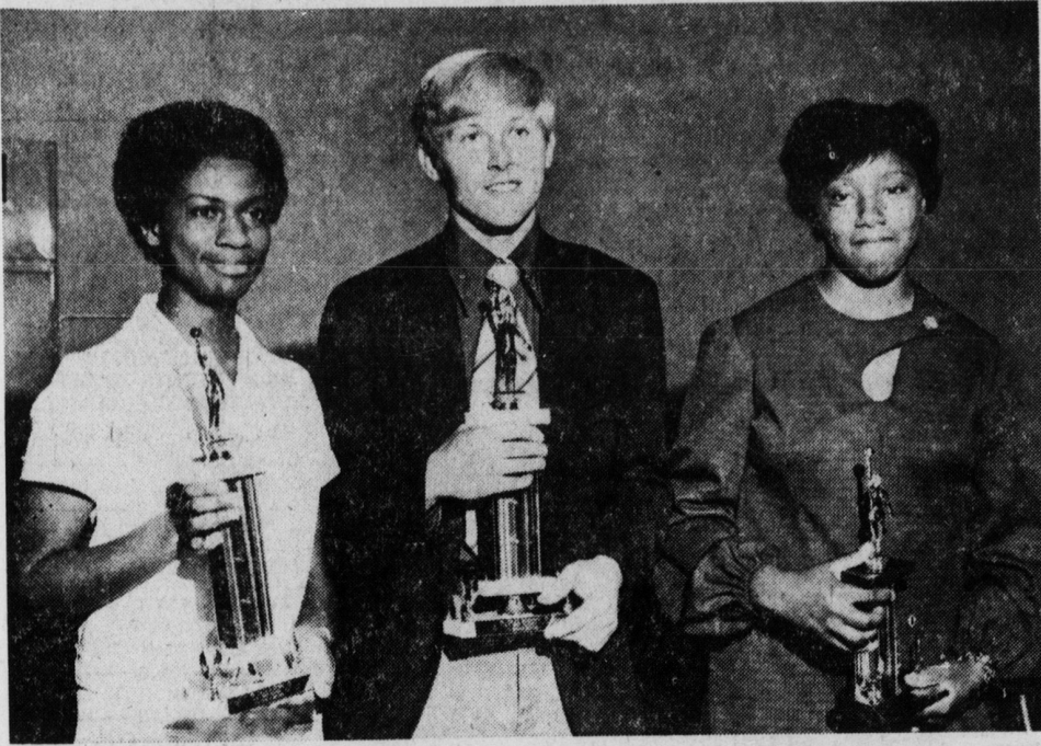
MOST VALUABLE CAGERS — The three Kings Mountain High basketball players shown above won most valuable player trophies...