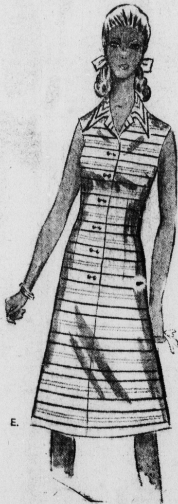
Dresses that keep their cool and take you comfortably and fashionably from place-to-place in town or continent to continent.