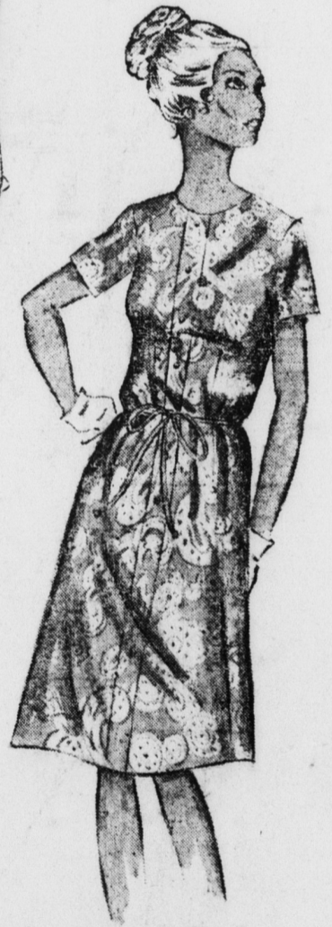
C. For a cool summer on the move lace-frosted voile shaped to a demi-fit. Washable Dacron® polyester/cotton voile in blue or pink. Lined. 12½-22½. $20.99