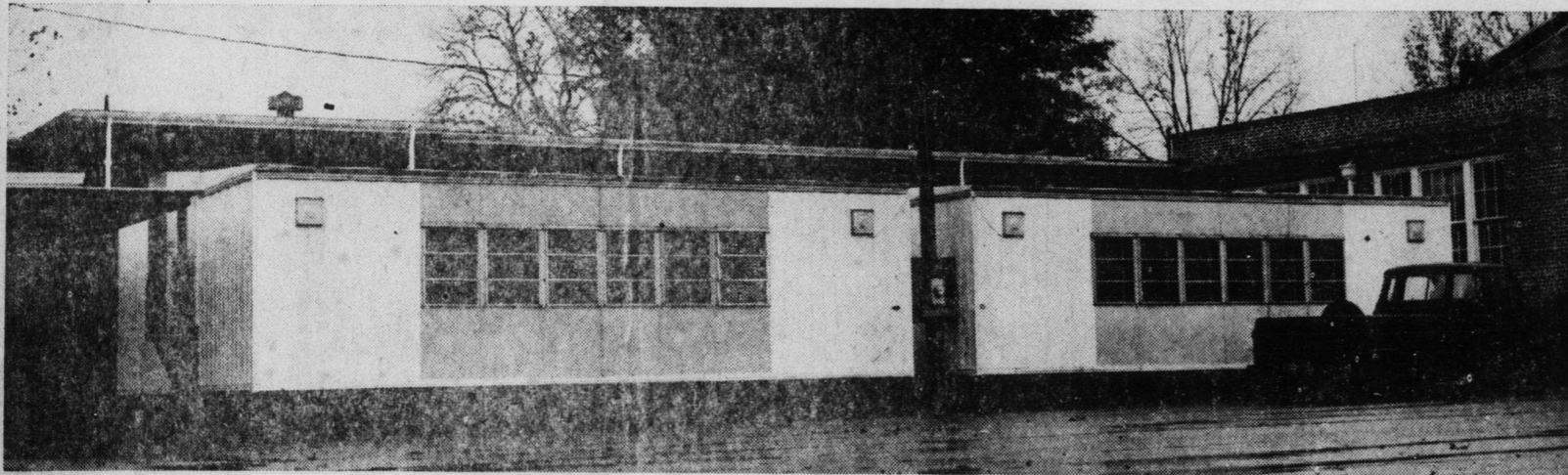
There are nine mobile classrooms now in use in the Kings Mountain District at Central Middle School. Six of these are located at K.M.H.S. two at West Elementary and one