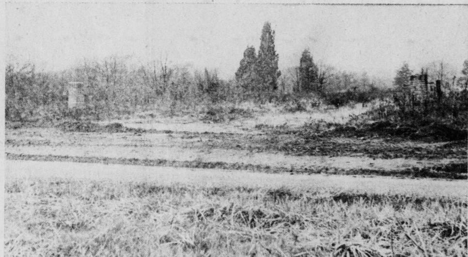
The proposed Junior High School will be located on Phifer Road approximately one mile beyond the present K.M.H.S. site. This will enable the new school to share the stadium and athletic fields now in use.