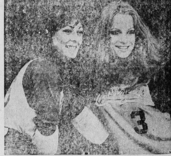
Now playing at the Joy Theater