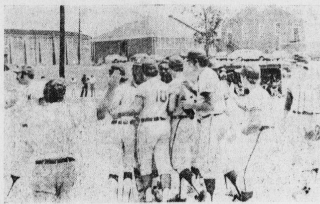
Monte Falls Sale At Third