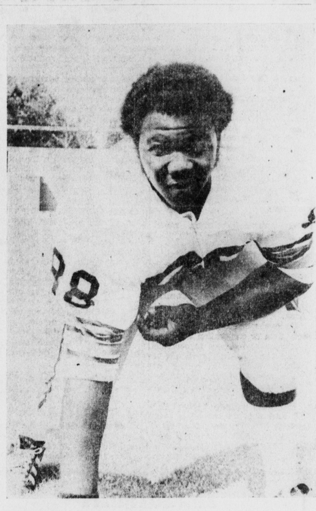
boro sees duty at tight end on offense and tackle on defense. The Mountaineers open 1973 play Friday night at Bessemer City against the Yellow Jackets.