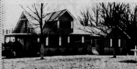
Grover Country Home

Chech with us for Commercial & Industrial Locations... Older Homes to be moved 739-4487