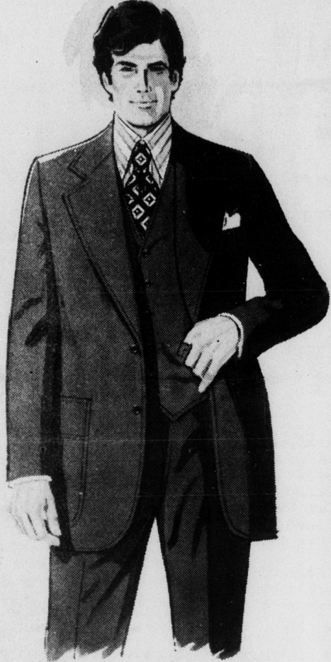
The twill blazer suit, by Cricketeer.

If there's a depressing sameness to your current suit wardrobe, here's the answer to your problem. Cricketeer's terrific looking vested twill blazer suit with classic soft shoulder styling, lively pocket treatment and a knack for looking just as great with a turtleneck as it does with shirt, vest and tie. It's made of a luxurious, wrinkle-shedding Dacron® and wool blend, and we have this handsomely tailored suit in a good selection of classic colors plus some very new-looking shades for Fall.