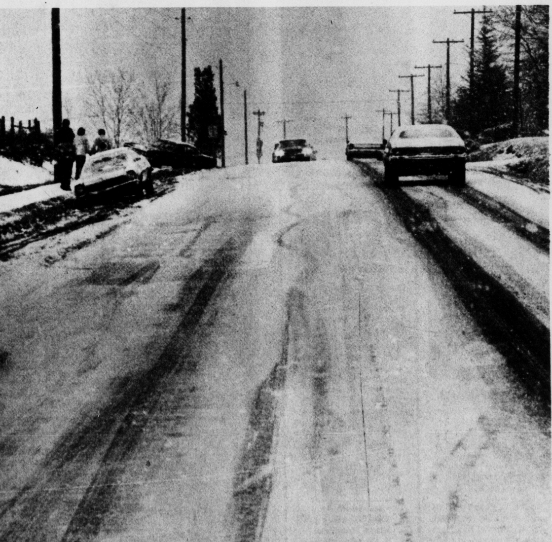
SLIPPERY HILL — One of the toughest hills to climb in Kings Mountain Monday was this one near Bennett Brick and Tile, where sev eral cars slipped into ditches. In this photo, two cars (at left) are already off the road