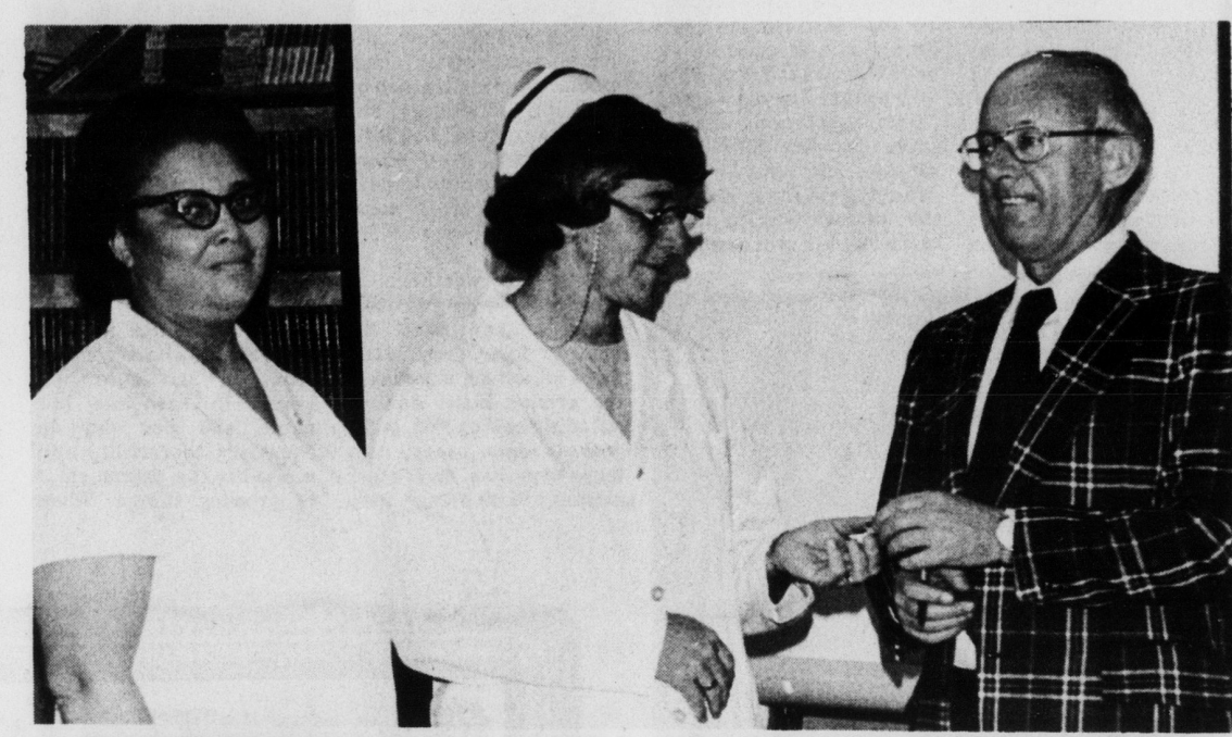
EMPLOYES HONORED — The Kings Mountain Hospital employes pictured were honored for 15 year service to the hospital at a drop-in tea Tuesday af-