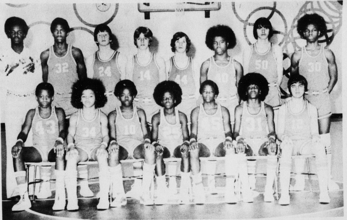
RUNNER-UP The Kings Mountain Junior High jayvee basketball team, pictured above, finished the season with eight straight victories to nail down second place in the Foothills Conference race. The Little Patriots finished runner-up to Lincolnton after dropping their first three games. Team members include,