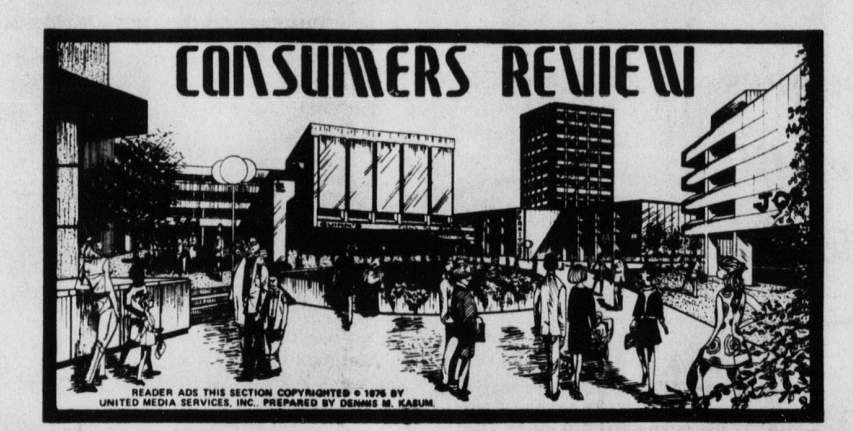
Page 8-MIRROR-HERALD-Tuesday, April 5, 1977