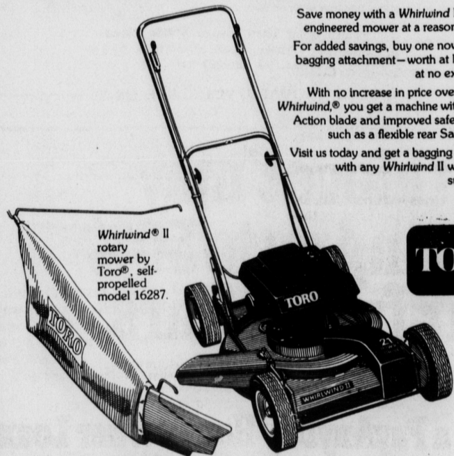
Whirlwind® II rotary mower by Toro® self-propelled model 16287.

Visit us today and get a bagging attachment with any Whirlwind II while bag kit supplies last.