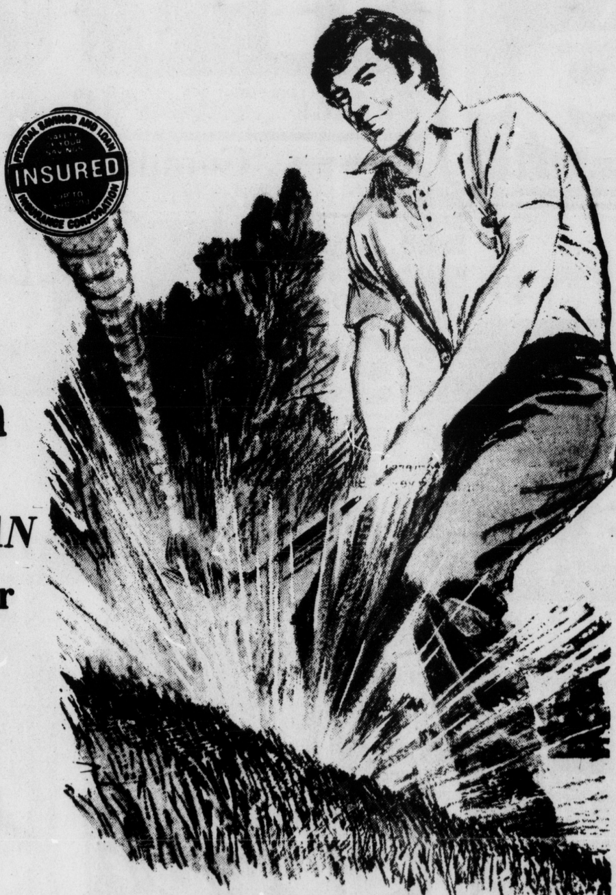
"It Does Make A Difference Where You Save!"

Our Savings Plans Offer You The Kind Of Security Everyone Needs.