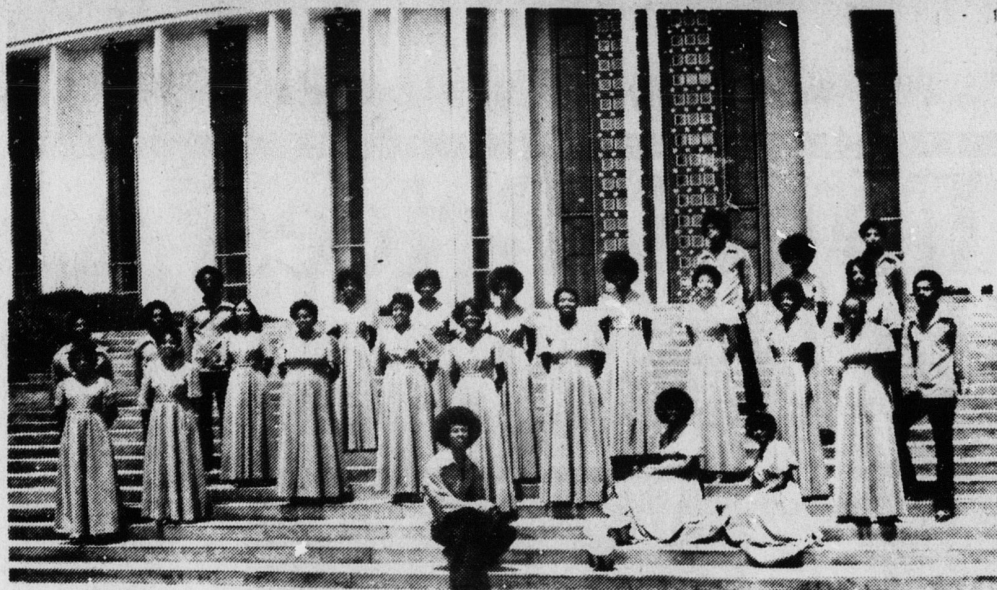
BLACK MASS UNITED CHOIR — Members of the Black Mass United Choir will perform at the Crusade For Christ being sponsored in August by Adams Chapel Methodist Church.

Persons needing further information are requested to call Cleveland Tech, 482-8351, between the hours of 8 a. m. and 4 p. m., Monday through Friday. Adults, 18 years of age and older, interested in enrolling in this class may do so at the first class meeting paying the $5 registration fee.